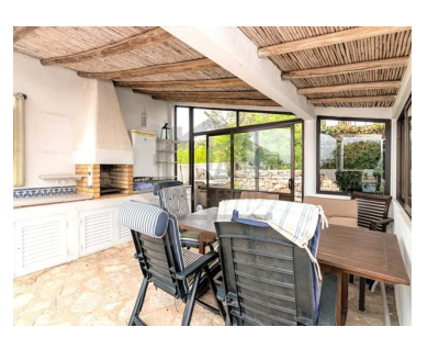
= 5 Bedrooms